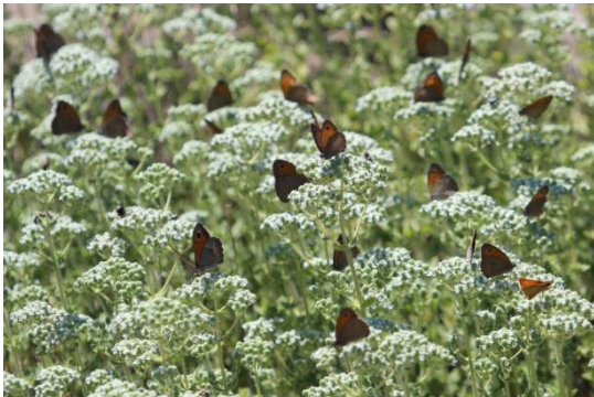
A host of nectaring butterflies

returned to the hotel very happy. After breakfast, we drove to Sigri fields and Faneromeni fords and beach where a pair of Black-crowned Night Heron, a Red-backed Shrike, and Little Bittern were all seen. Tiny frogs were everywhere in the shallow waters of the ford. Near the beach, a large, heavy looking falcon flew over, which Bernie eventually identified as a Lanner Falcon (only a couple of pairs are resident on the island so this was quite a find). A pair of Lesser Kestrels also circled and hovered overhead. On the track to Eresos, Black-eared Wheatears were a frequent roadside feature. We walked along the dry gully at Sigri Old Sanatorium where we added Whinchat and Stonechats and another Lesser Grey Shrike. Additional interest was found in a fall of Black-headed Buntings, which shot out of a tiny bush as we approached and masses upon masses of butterflies nectaring on flower heads, including Meadow Brown, Small Copper and an orange Skipper.