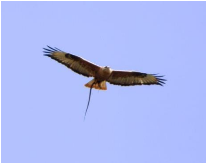
Long – legged Buzzard carrying a snake

We stayed local for our early morning venture and searched for Zitting Cisticola at the Christou River but had no luck. We again drew a blank on crakes at the Metochi River, but unusually bold Cetti's Warbler, clumsy Great Reed Warblers and skulking Little Bittern put on a great show. In the Potamia Valley there was little on the reservoir but a Long-legged Buzzard soared into view, flashed a ginger tail and