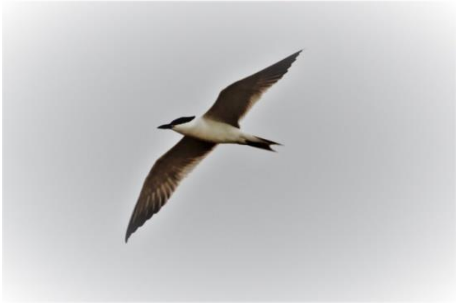
Gull – billed Tern

this area. Bernie heard a Greenshank but this was not seen by anyone. Returning via the salt pans, we had fabulous views of a Gull-billed Tern, gliding up and down the channel long enough for us to study the key identifying features. We searched in vain for Scops Owl at the mini soccer pitch, but were too tired to persevere, and returned home more than satisfied with another enjoyable day of birding.